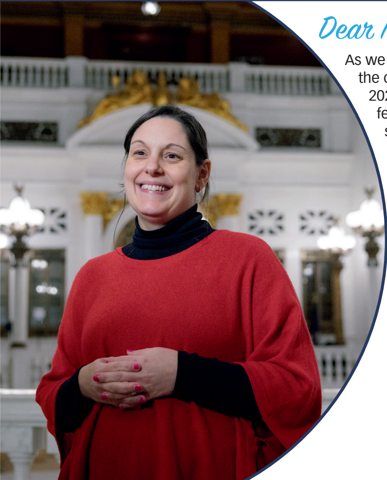
Senator Amanda M. Cappelletti 17th Senatorial District