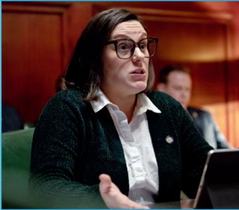
Senator Cappelletti expresses her opposition to Senate Bills 1 and 130 in the inaugural meeting of the Senate State Government committee on Monday, January 9, 2023.

Health & Human Services and to join the Environmental Resources & Energy and Communications and Technology Committees. I'm excited to get back to work and continue fighting for our values in Harrisburg!