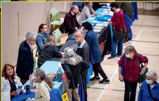
Senior constituents browse a variety of vendors at the Senior Fair.