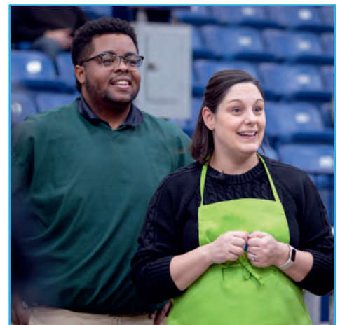
Senator Cappelletti participates in the Celebrity Honey Extraction Competition at the 107th Farm Show.