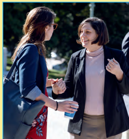
Senator Cappelletti chats with a reproductive rights advocate prior to a press conference on the Pennsylvania Capitol Steps.

Second, I'm introducing Statewide Rental Rate Protections. This legislation that would enforce rental rate protection measures to help combat unfair and predatory rental increases. It is important to note that this legislation exempts small landlords with less than 15 units. With Pennsylvania's minimum wage remaining at $7.25, and rapidly increasing rent prices, we must act to protect all tenants from predatory situations that could force them out of their homes and away from their families, places of work, education, and healthcare.