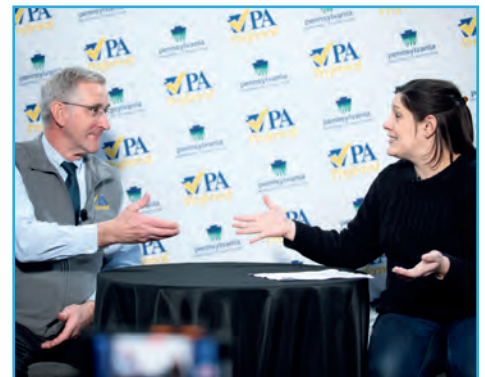
Senator Cappelletti interviews Secretary of Agriculture Russell Redding at the 107th Farm Show.