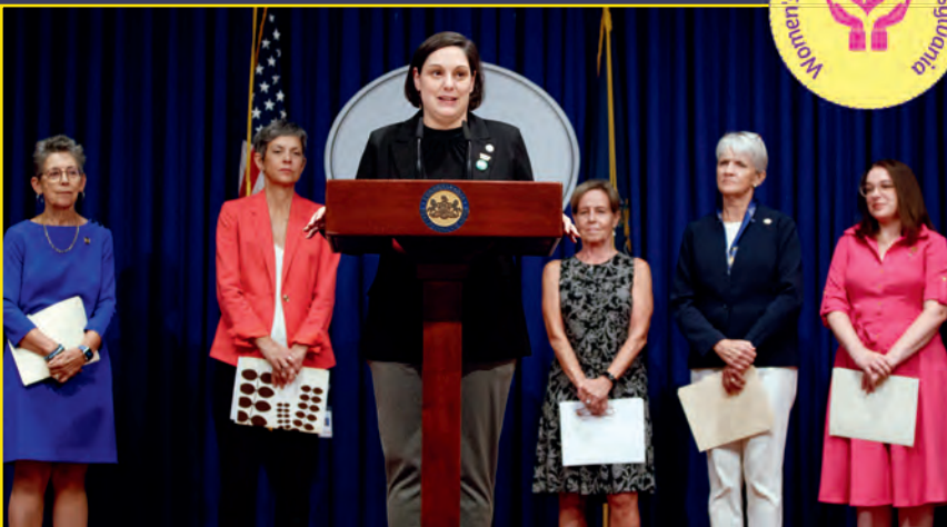
Senator Cappelletti, co-chair of the Women's Health Caucus, speaks at a press conference to reaffirm the caucus's commitment to protect and expand reproductive healthcare.

I'm thrilled to Co-Chair the Pennsylvania Women's Health Caucus for another legislative session. Through this caucus, legislators and advocates work together to advance legislation and policies that promote equity and protect the health and wellbeing of women, gender expansive people, and families in Pennsylvania. This session, we have joined with the Pennsylvania Black Legislative Caucus to create a Subcommittee on Women and Girls of Color that advances the work of both caucuses.