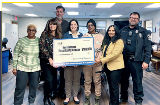
Senator Cappelletti presents a $100,000 state grant to the dedicated staff of Norristown Hospitality Center.