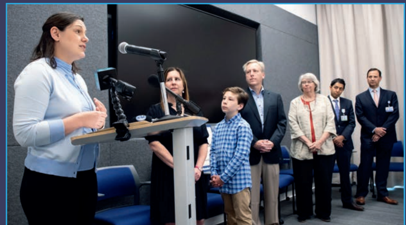
Senator Cappelletti announces a grant for $100,000 awarded to Children's Hospital of Philadelphia for research into Celiac Disease and potential treatments.