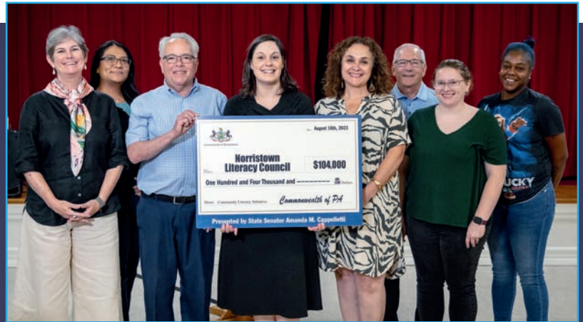
Senator Cappelletti presents a grant for $104,000 to the Literacy Council of Norristown.