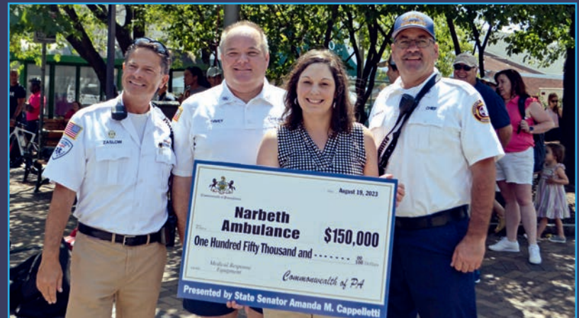
Senator Cappelletti presents a grant for $150,000 to the Narberth Ambulance.