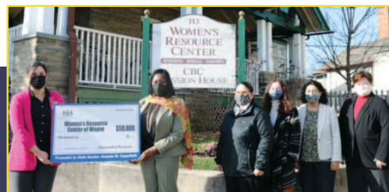
Senator Cappelletti awards the Women's Resource Center in Radnor with a $50,000 grant to increase their programing that gives low-income women access to a financial education in times of life transitions.