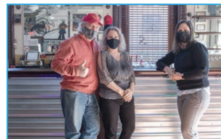
Five Saints Distillery